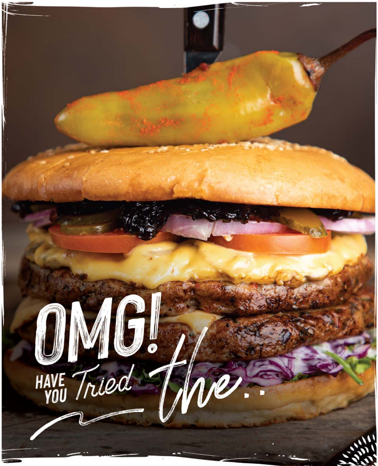
TRY THIS THE BIG MUTTON BURGER The big boss of all burgers