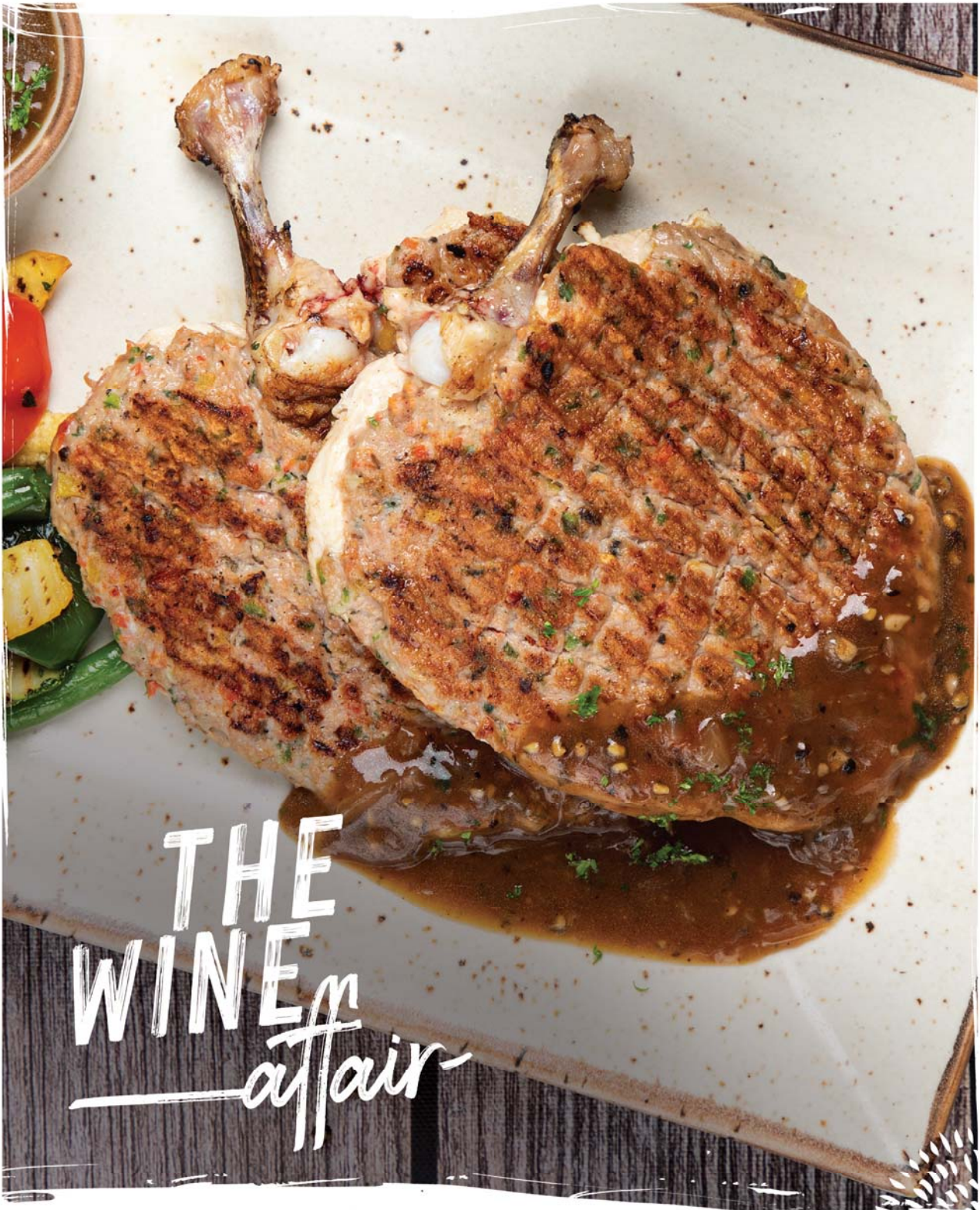
TRY THIS GRILLED CHICKEN STEAK WITH RED WINE SAUCE Grilled chicken breasts layered with minced chicken, served with herb rice & red wine sauce