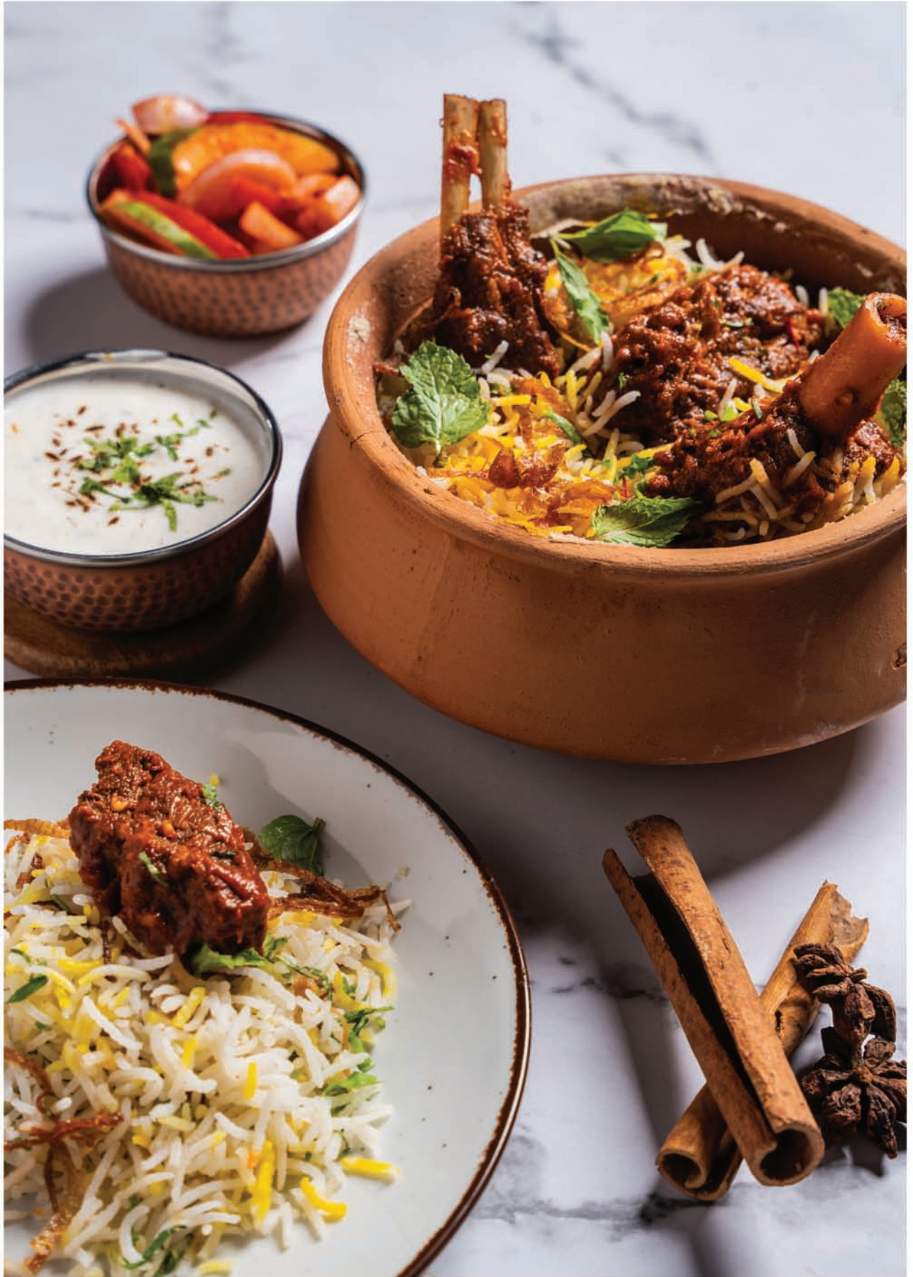
MUTTON DUM BIRYANI