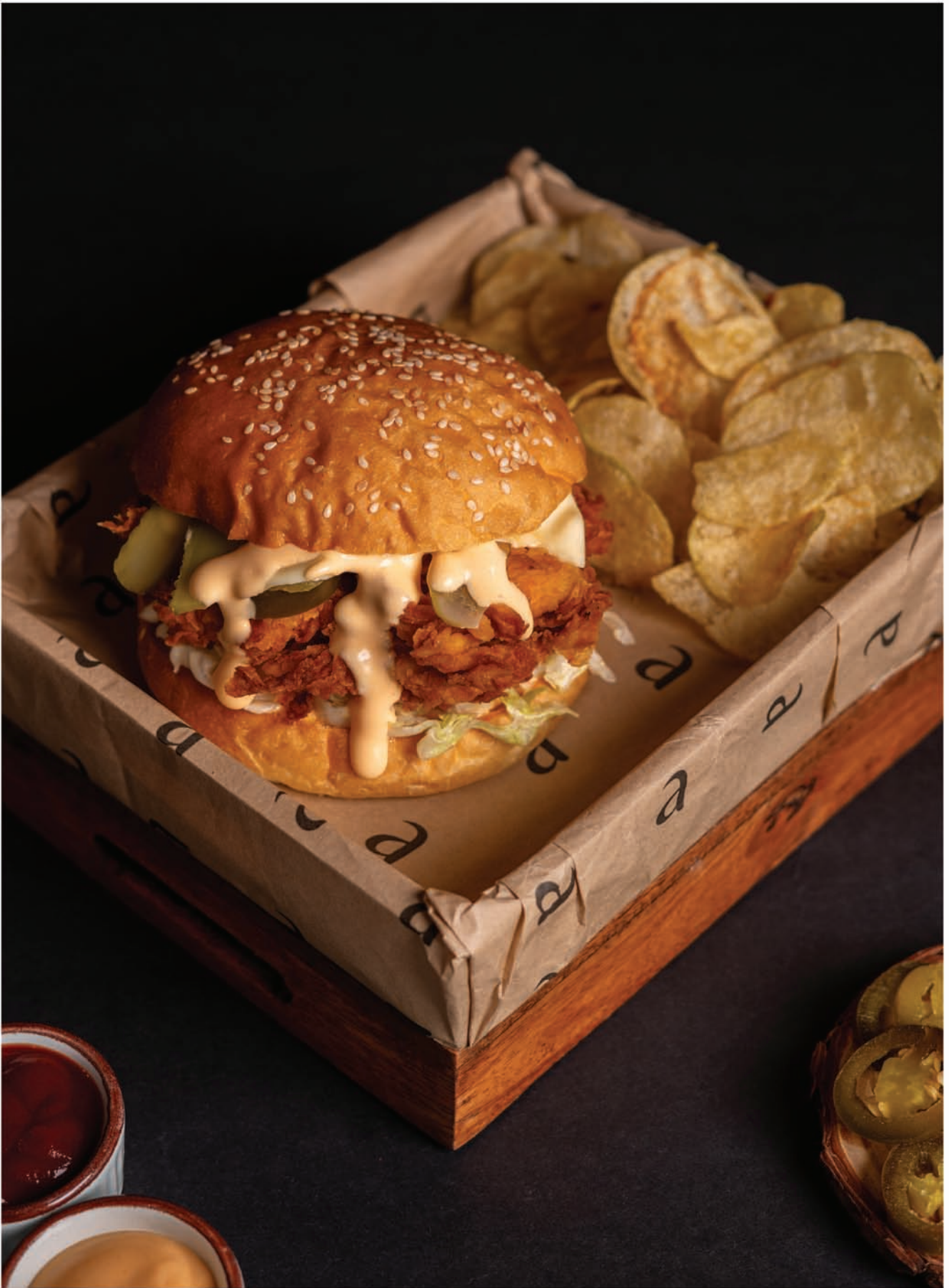
CRISPY FRIED CHICKEN BURGER