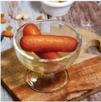
✓ GULAB JAMUN (2 pcs.) ₹395