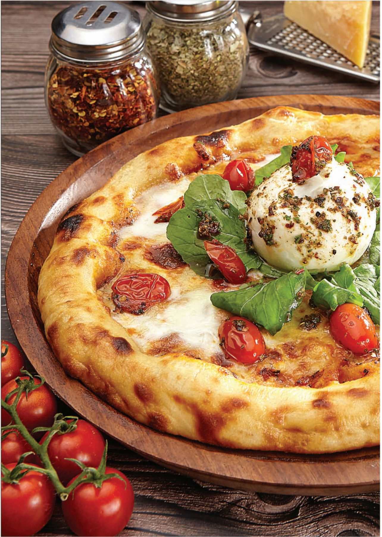
▼ BURRATA PIZZA