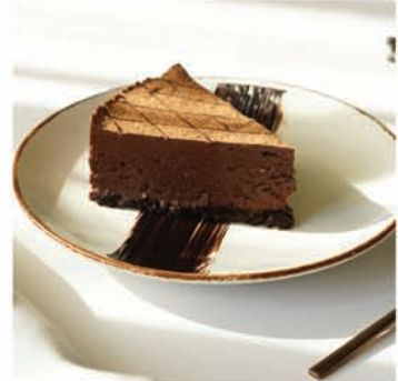
VALRHONA CHOCOLATE DECADENCE - ₹395