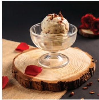
✓ GULKAND ICE CREAM (DOUBLE SCOOP) ₹395