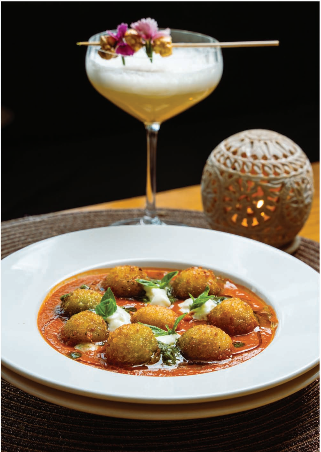
✓ GOLDEN FRIED CHEESE BALLS WITH NEAPOLITAN SAUCE