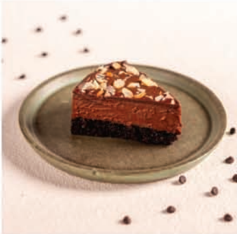
✓ QUEEN'S FUDGE CAKE ₹395