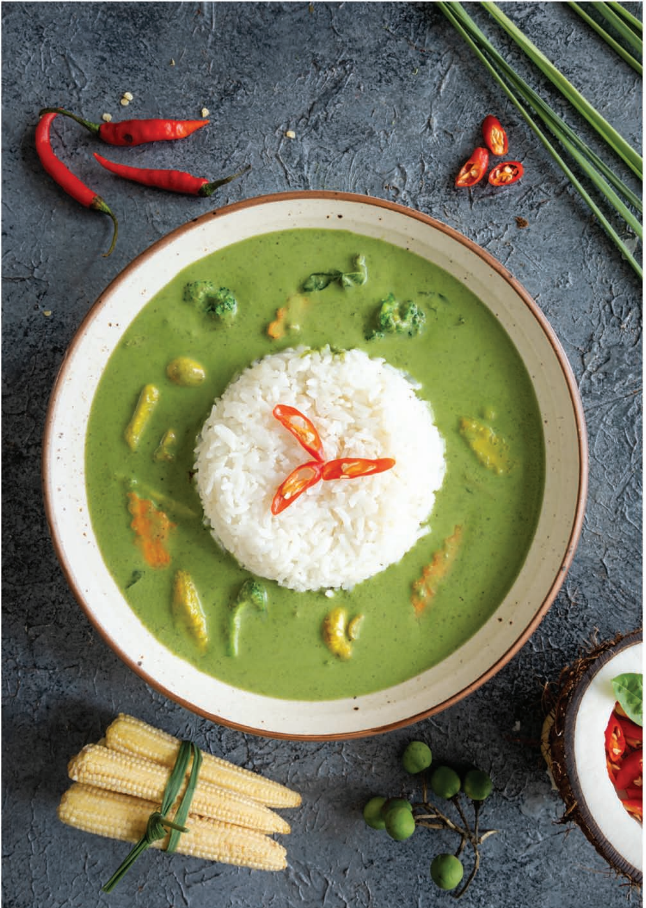
THAI GREEN CURRY WITH ————— ₹775 / ₹825 VEGETABLES / CHICKEN