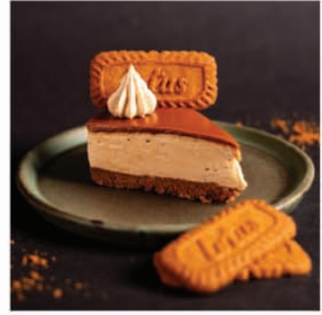
✓ BISCOFF CHEESECAKE ₹395